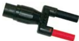
Banana (female) - BNC (male) Adaptor Catalog #2118.46 (optional)

*These two models are specifically designed to be used with recorders or power analyzers with a Voltage AC input. A scale factor may need to be entered into the recorder to display the exact value.